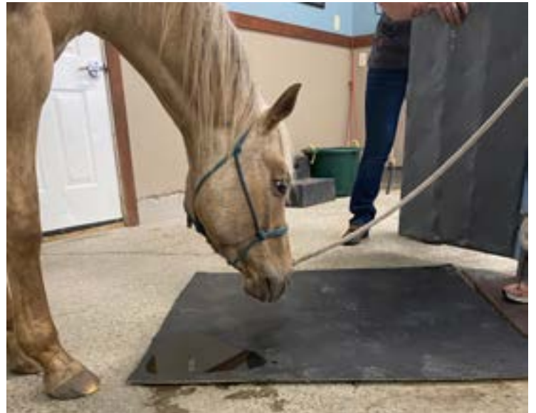
Image 2: A horse closely inspecting new footing before stepping forward onto it.