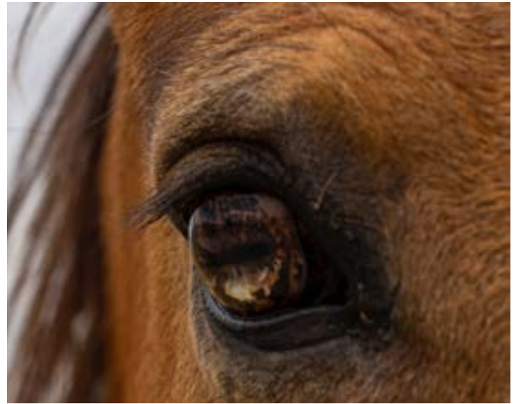
Image 1: Close-up of a horse's eye. He has heterochromia, with a portion of his iris being a different, blue color.